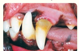
Photo of gum disease in an adult dog. Note the build up of yellow calculus.