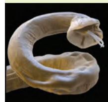
Electron micrograph of an adult lungworm

It is also known as the French/ small heartworm or lungworm (to distinguish it from Dirofilaria – the large heartworm found in mainland Europe and the USA).